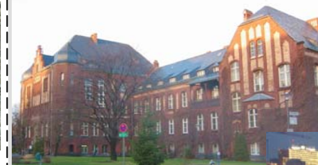
„Alte Nervenklinik“ Charité, Berlin