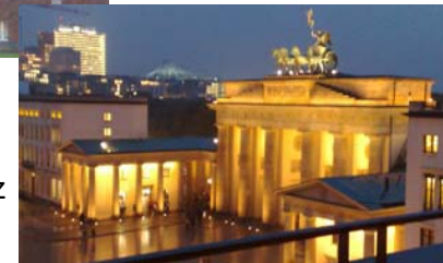
Brandenburg Gate and Potsdamer Platz at night, Berlin